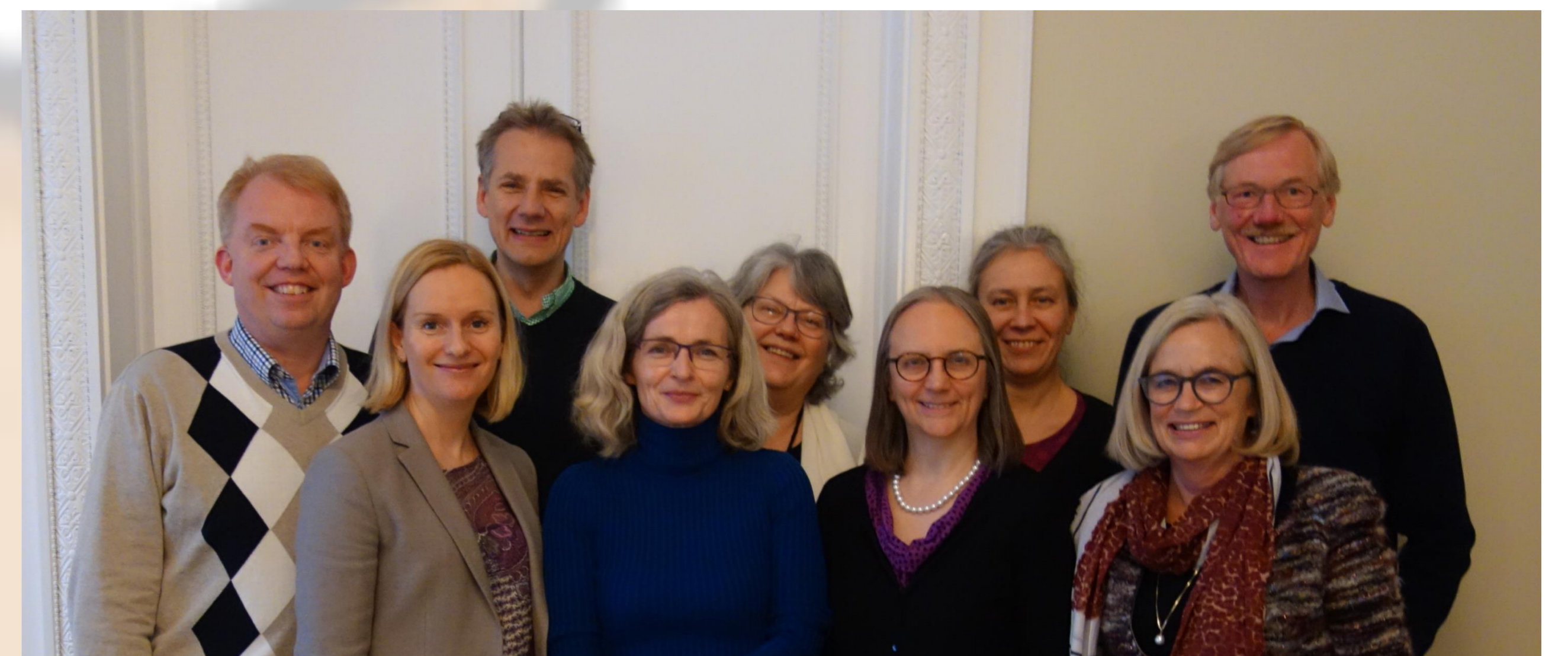
NSCPM Steering Group 2013-2016

Palliative medicine has been approved as a formal competence field or subspecialty in Finland, Norway, Denmark and Sweden and expected in Iceland 2015/2016. In all countries, the Nordic course, or an equivalent course, is required for the theoretical part.